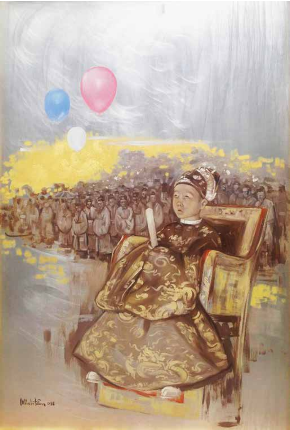
Trần Minh Tâm Vì Tuổi Thơ Đã Mất Của Vua Duy Tân 2 - The Lost Childhood of Duy Tan 2 2018 Mixed media paint on aluminum 120 x 80 cm