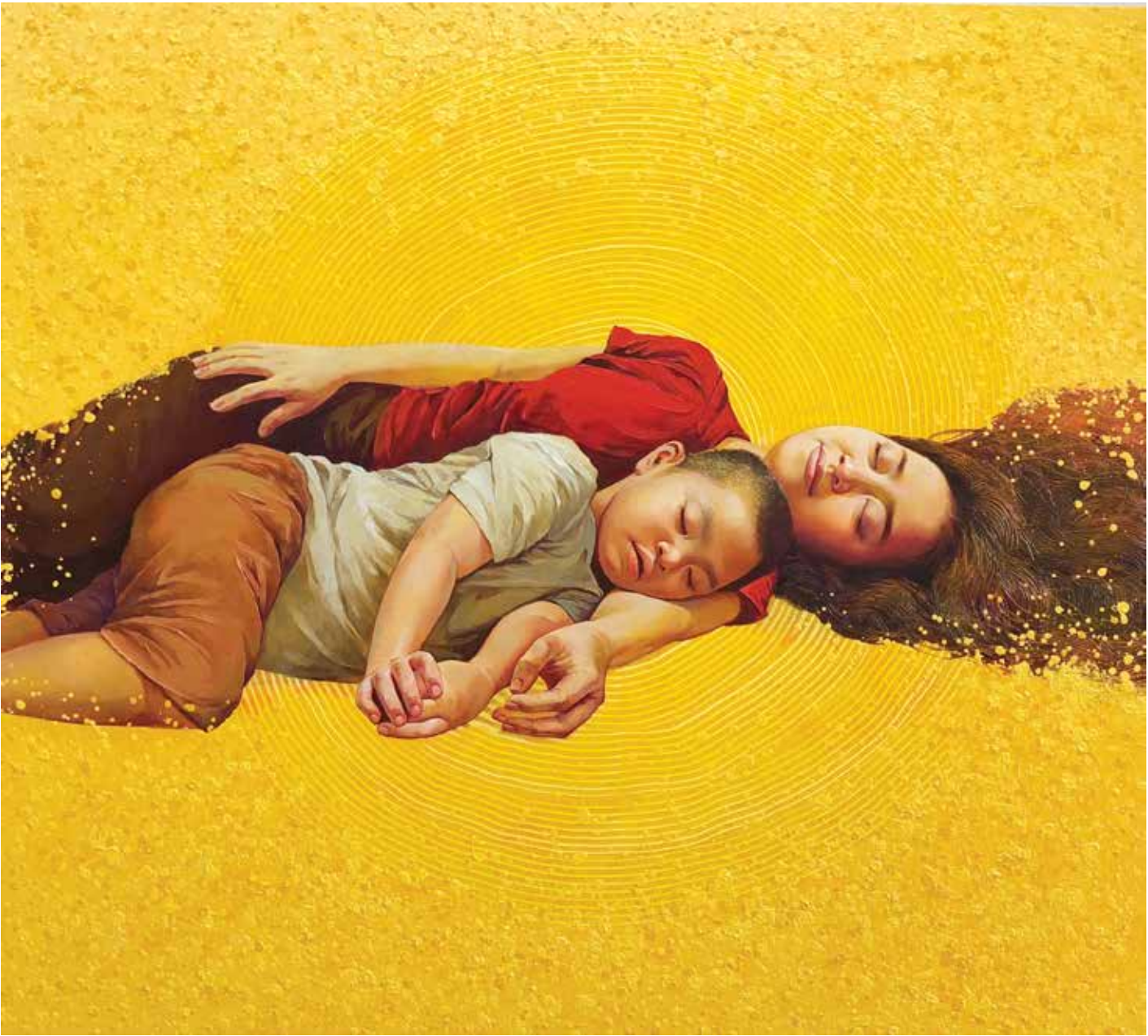
Lim Khim Ka Ty Vòng Tay Mẹ - Mother's Arms 2018 Oil on canvas 140 x 155 cm