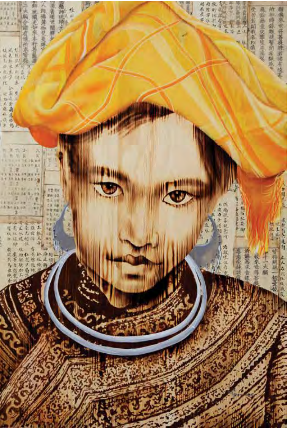
Ngô Văn Sắc Cô Gái H'mong - H'mong Girl 2018 Wood burn, mixed media on wood 119 x 80 cm