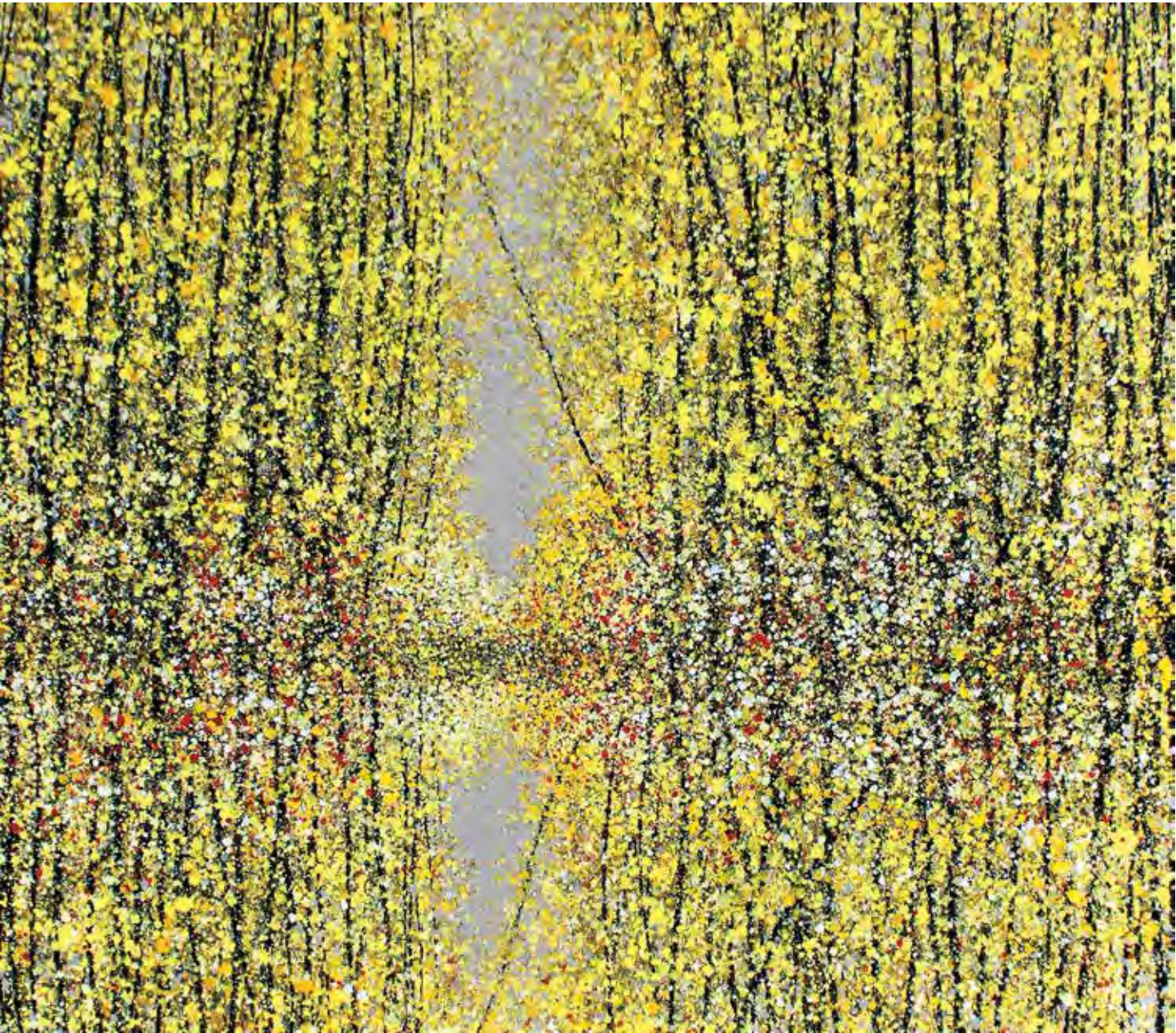
Liêu Nguyễn Ao Thu - Autumn Pond 2018 Acrylic on canvas 140 x 160 cm