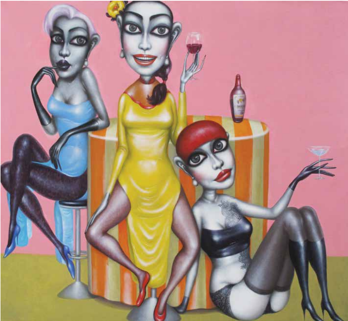
Bùi Thanh Tâm Những Kẻ Điên Trong Bar - Crazy People In The Bar 2015 Oil on canvas 120 x 130 cm