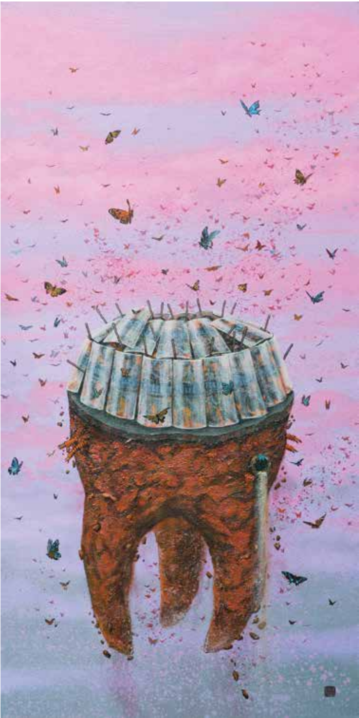
Phạm Huy Thông Mùa Xuân Đến - Spring Comes 3 of 5 Real Estate Series 2018 Acrylic on canvas 160 x 80 cm