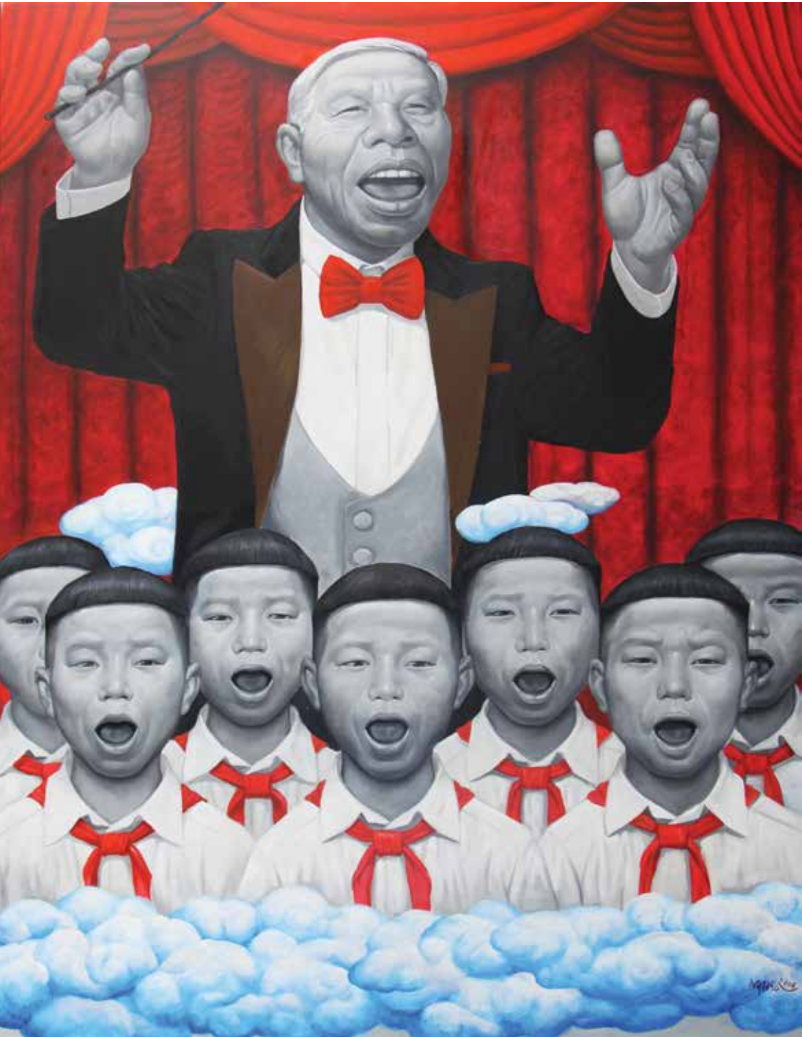
Nguyễn Hùng Sơn Đồng Ca - Choir 2018 Oil on canvas 160 x 120 cm