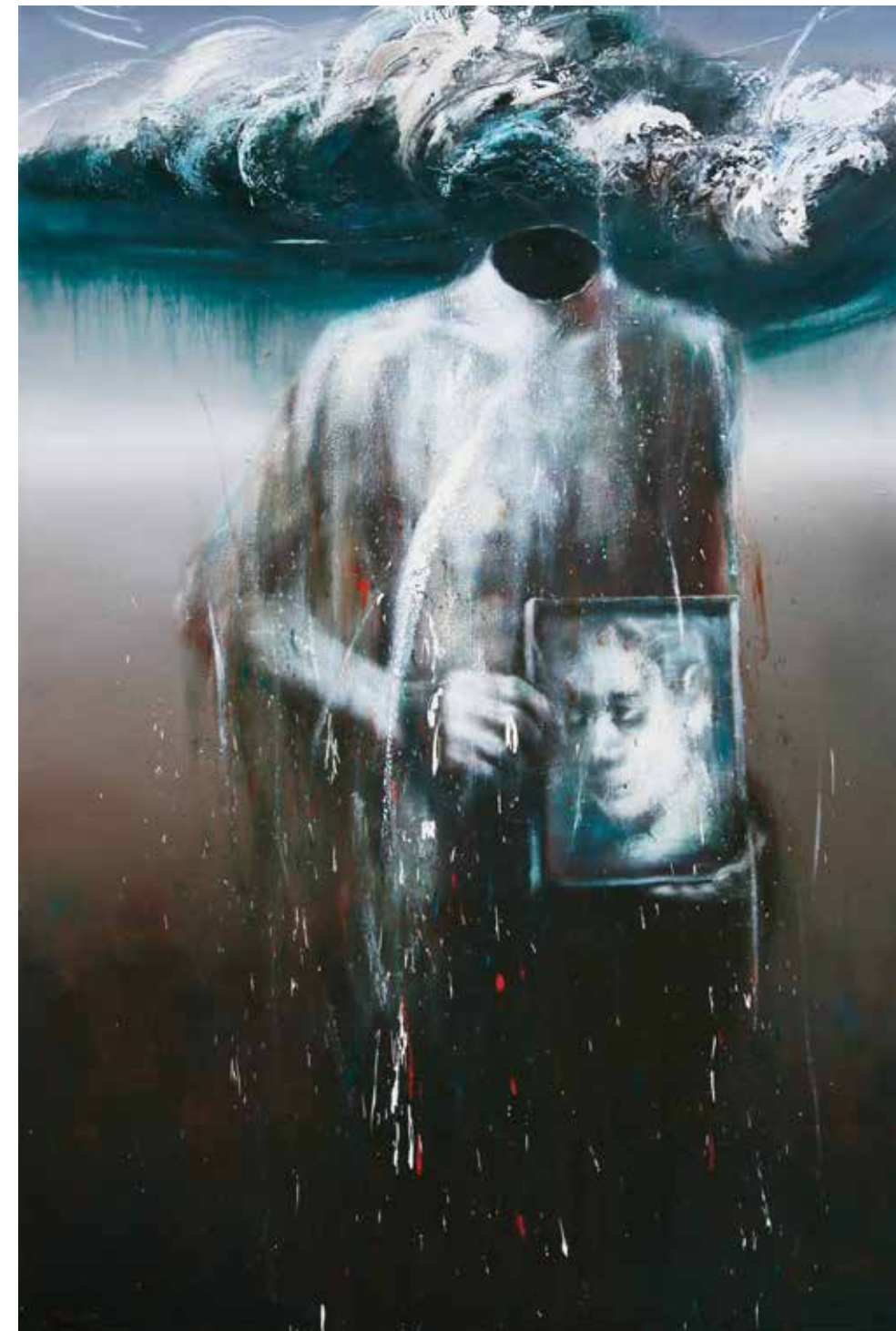
Trương Thế Linh Thiên Đường Tìm Đâu - Where Is The Heaven 2017 Acrylic on canvas 150 x 100 cm

2018 CTG Nomad , Craig Thomas Gallery group exhibition, New York City, USA CTG 9th Anniversary , Craig Thomas Gallery, Ho Chi Minh City 2016 East Meets West , Holland Young Artists Exhibition “ Today ”, Hanoi Creative City, Hanoi Túm Tím , Hue 2015 The Grapevine Selection Volume II , Vietnam Fine Arts Museum, Hanoi Chòn Chòn by young artists from Hanoi and Hue, Center for Contemporary Arts, Hanoi. After that, the exhibition was on display at the Hue Museum of Culture 2014 Laotian Wind , Tu Do Gallery, Ho Chi Minh City Chain , Tu Do Gallery, Ho Chi Minh City Quầy , Then Café, Hue 2013 Exhibition of Vietnamese Young Artists Năng Lượng Cổ Đô , New Arts Foundation, Hue Vietnamese Fine Arts Exhibition II at Embassy of Denmark in Vietnam, Hanoi The Dogma Prize in Self-Portraiture , Ho Chi Minh City Fine Arts Museum