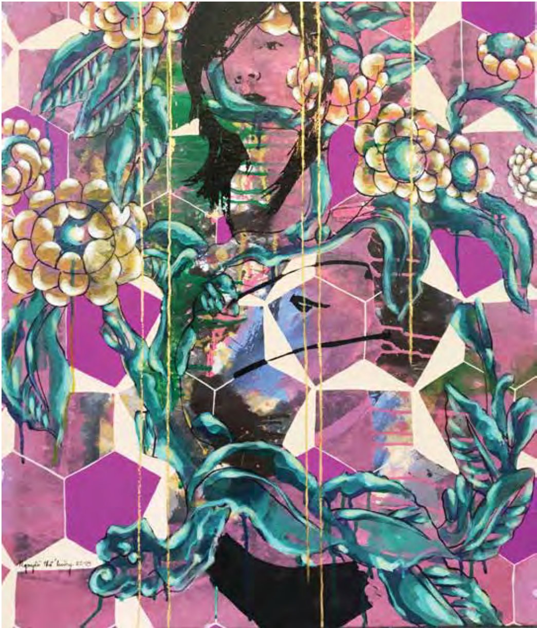
Nguyễn Thế Hùng Thiếu Nữ Trong Vườn 2 - Lady In The Garden 2 2018 Acrylic on do paper mounted on canvas 76 x 66 cm