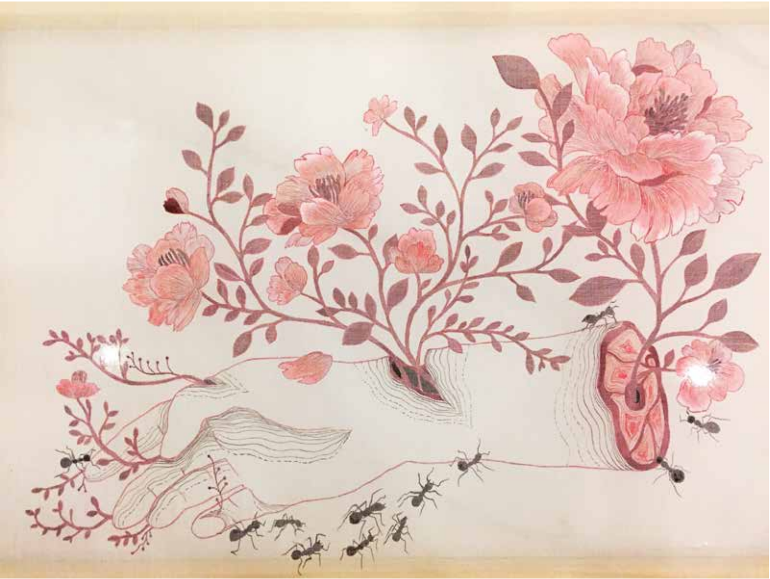
Khoa Lê Tay Mẫu Đơn - Peonies Hand 2018 Acrylic ink on silk 40 x 60 cm