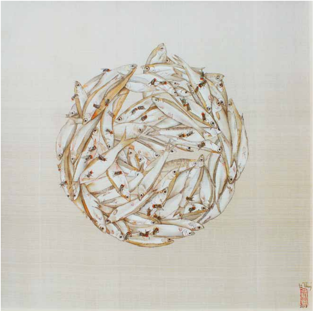
Lê Thúy Khoảng Trắng 12 - White Space 12 2018 Watercolor on silk 55 x 55 cm